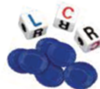
LEFT, RIGHT, CENTER