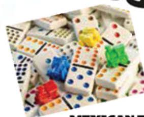
MEXICAN TRAIN DOMINOES

SPACE IS LIMITED - R.S.V.P. EARLY (BUT NO LATER THAN JULY 6 TH )