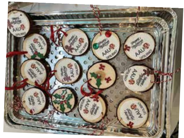
Capital Branch Ornaments