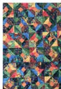
1. Crazy Colorful Quilt – 53" x 65" Anonymous Donor