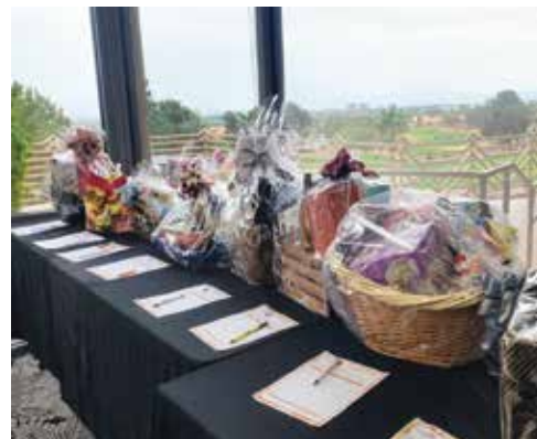
Silent Auction baskets from November Fundraiser